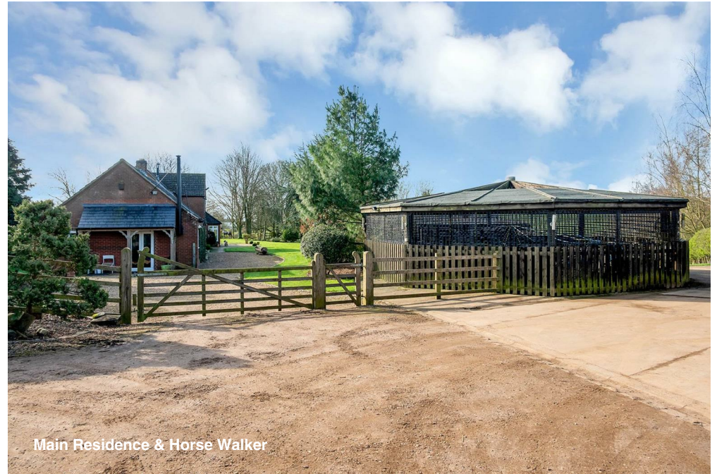
Main Residence & Horse Walker