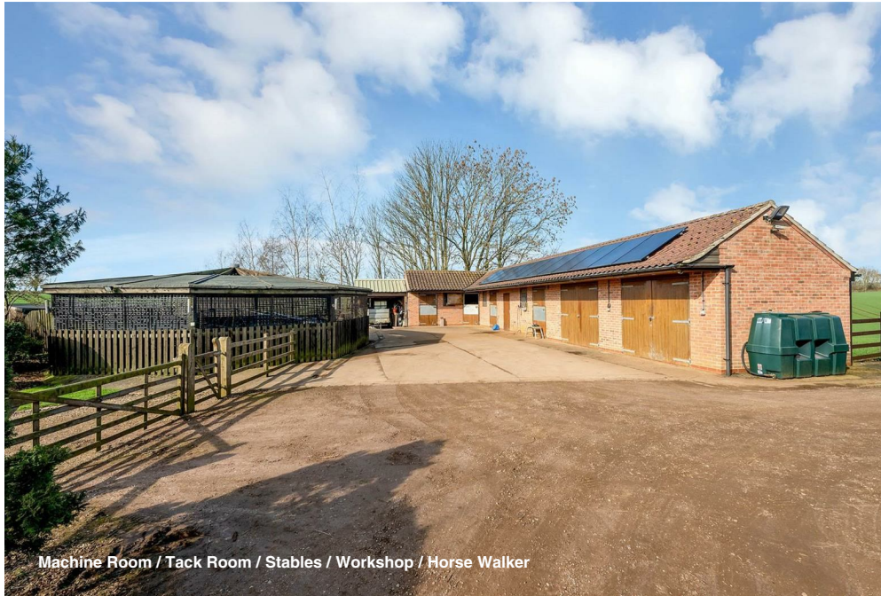
Machine Room / Tack Room / Stables / Workshop / Horse Walker