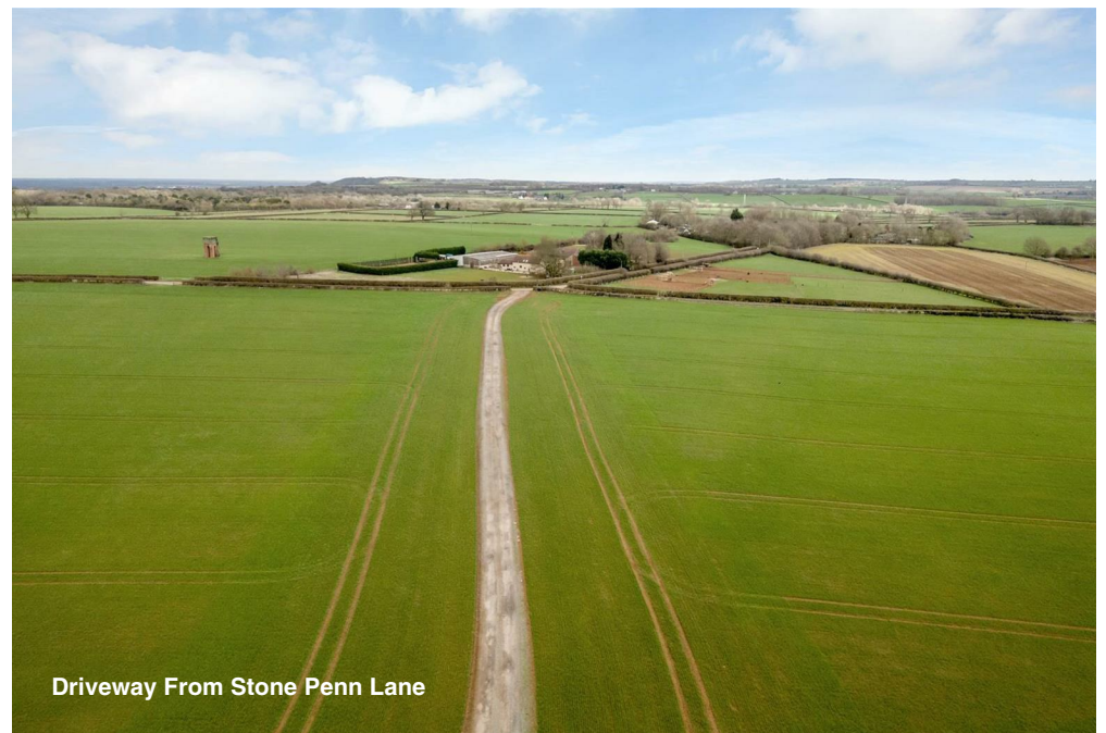
Driveway From Stone Penn Lane