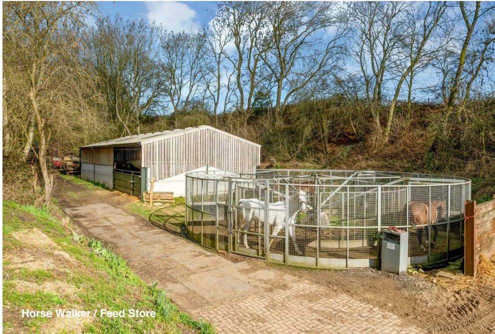
Horse Walker / Feed Store