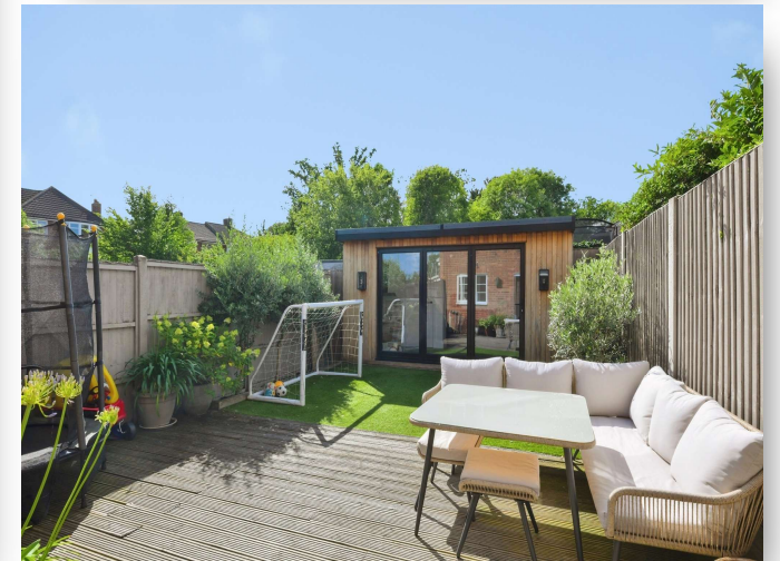
Smarts Green, Cheshunt Waltham Cross EN7 6BD