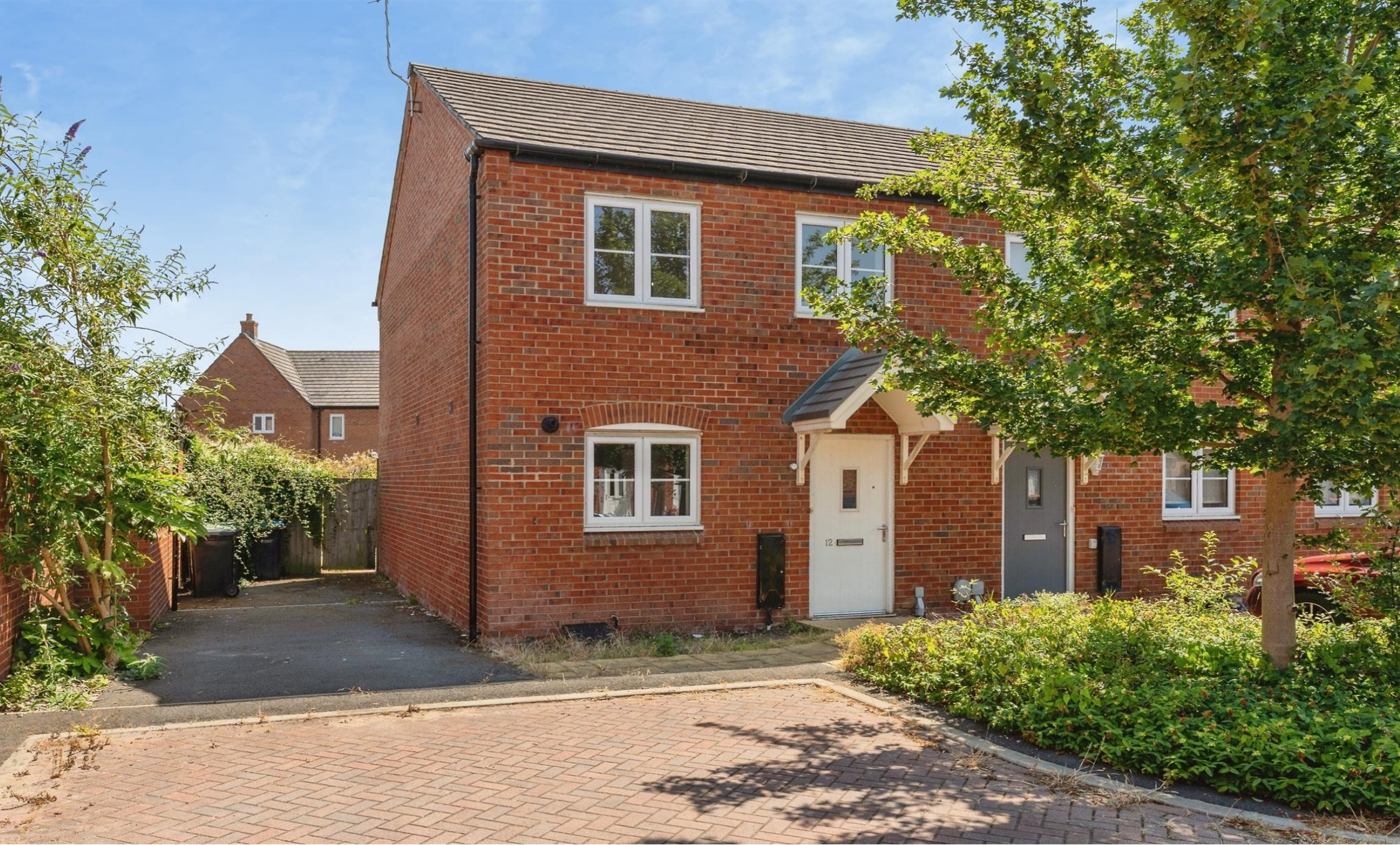
Malayan Place, Saughton Chester CH3 6GJ