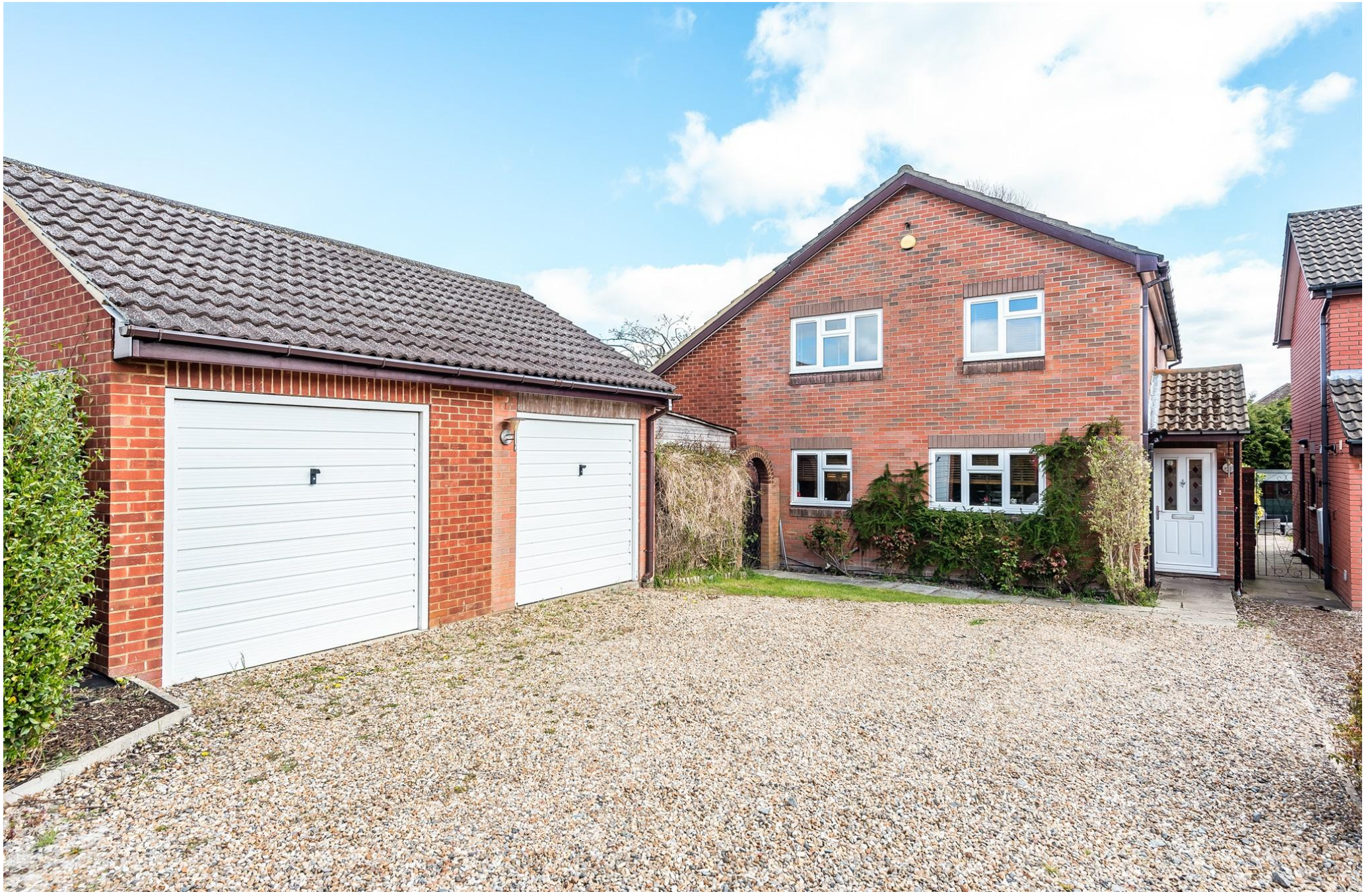
Thorntree Drive Tring HP23 4JE