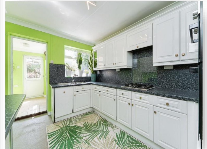
Lime Kiln Lane, Feltwell, Thetford, IP26 4BG