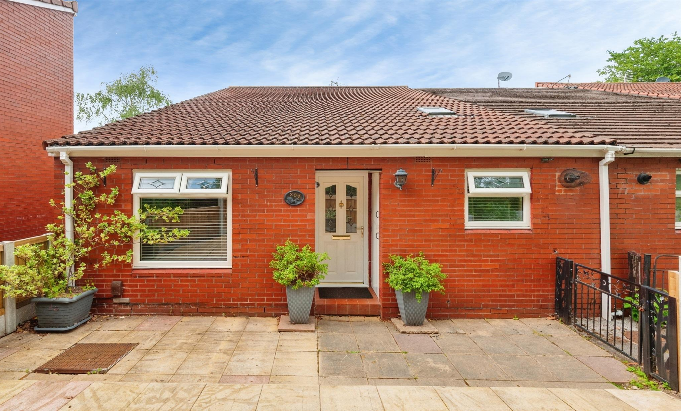
Stonelea, Windmill Hill Runcorn WA7 6LH