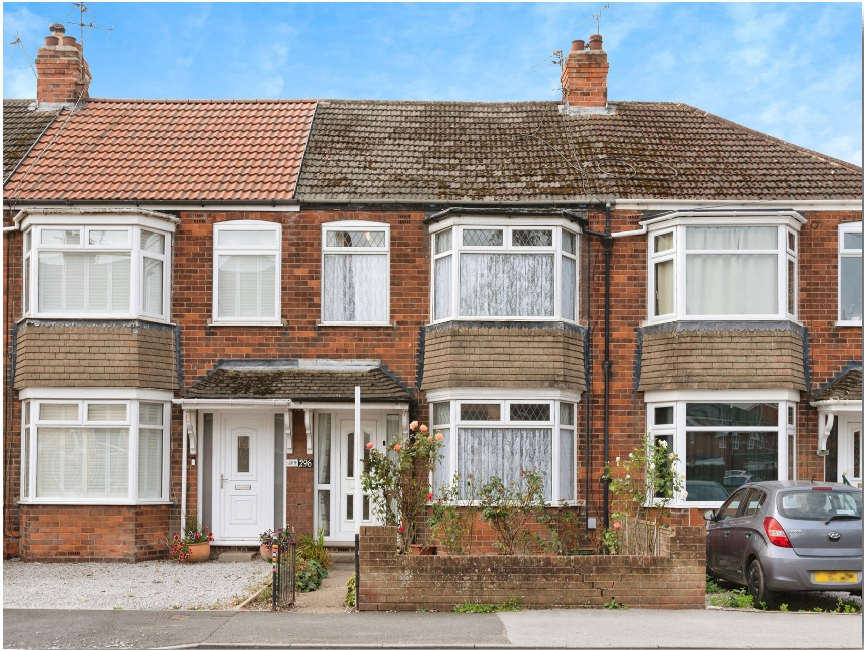
Grovehill Road, Beverley, HU17 0JE