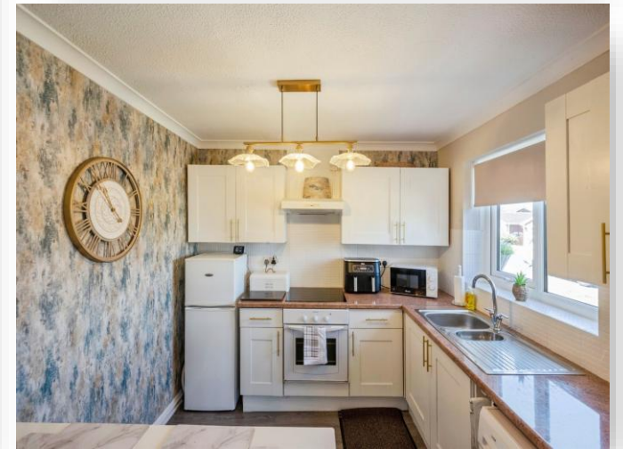
Perth Close, Mexborough S64 0QT