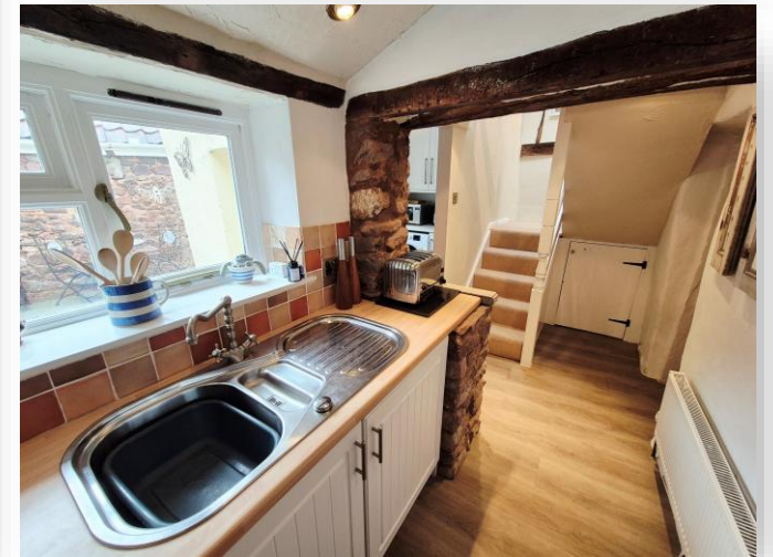
Chapel Row, Dunster, MINEHEAD, TA24 6RU