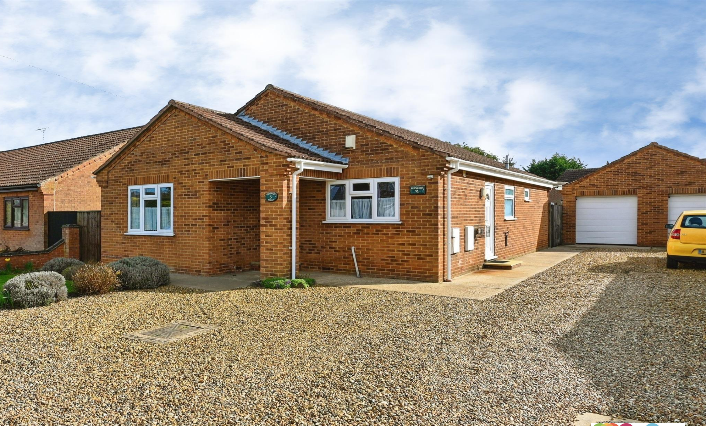
Premier Mills, Terrington St. Clement KING'S LYNN PE34 4DU