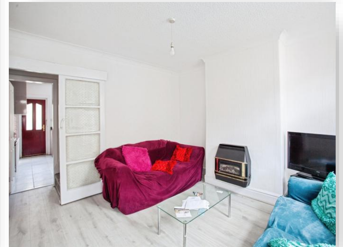
Bramwell Street, Eastwood Rotherham S65 1RZ