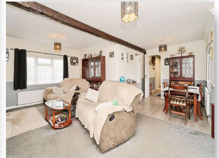
Green Lane Estate, Pudding Norton, Fakenham, NR21 7LU