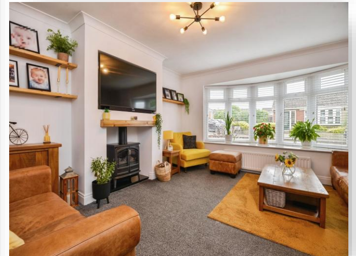
Diomed Court, Marton-In-Cleveland Middlesbrough TS7 8RB