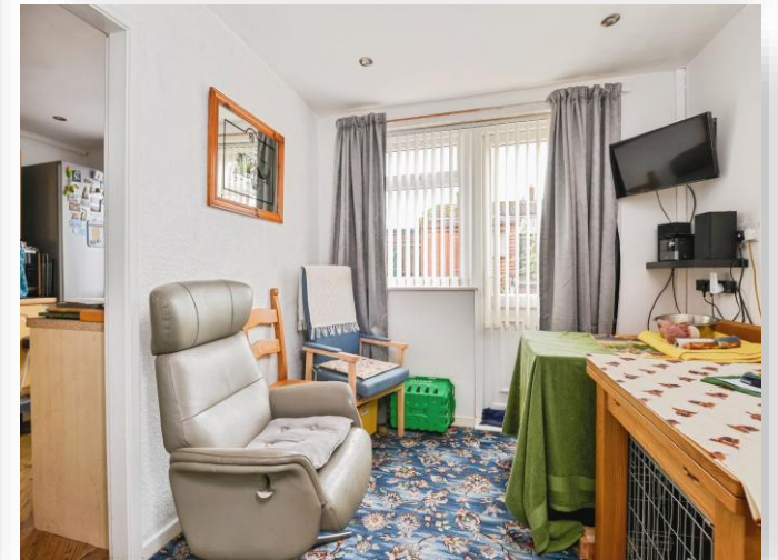
Talbot Street, Stockton-On-Tees TS20 2AY