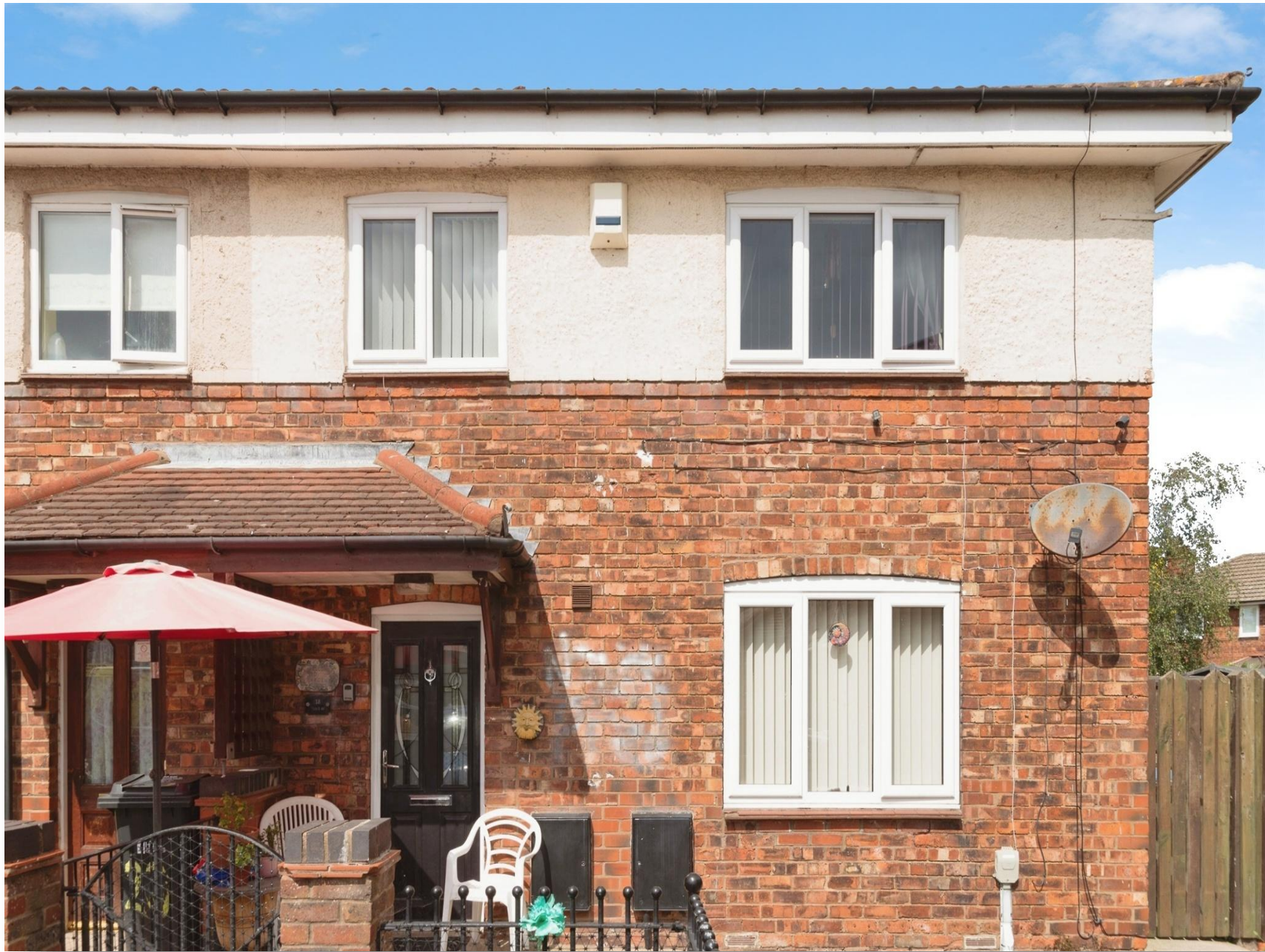
Wadham Grove, Hull, HU9 3RY