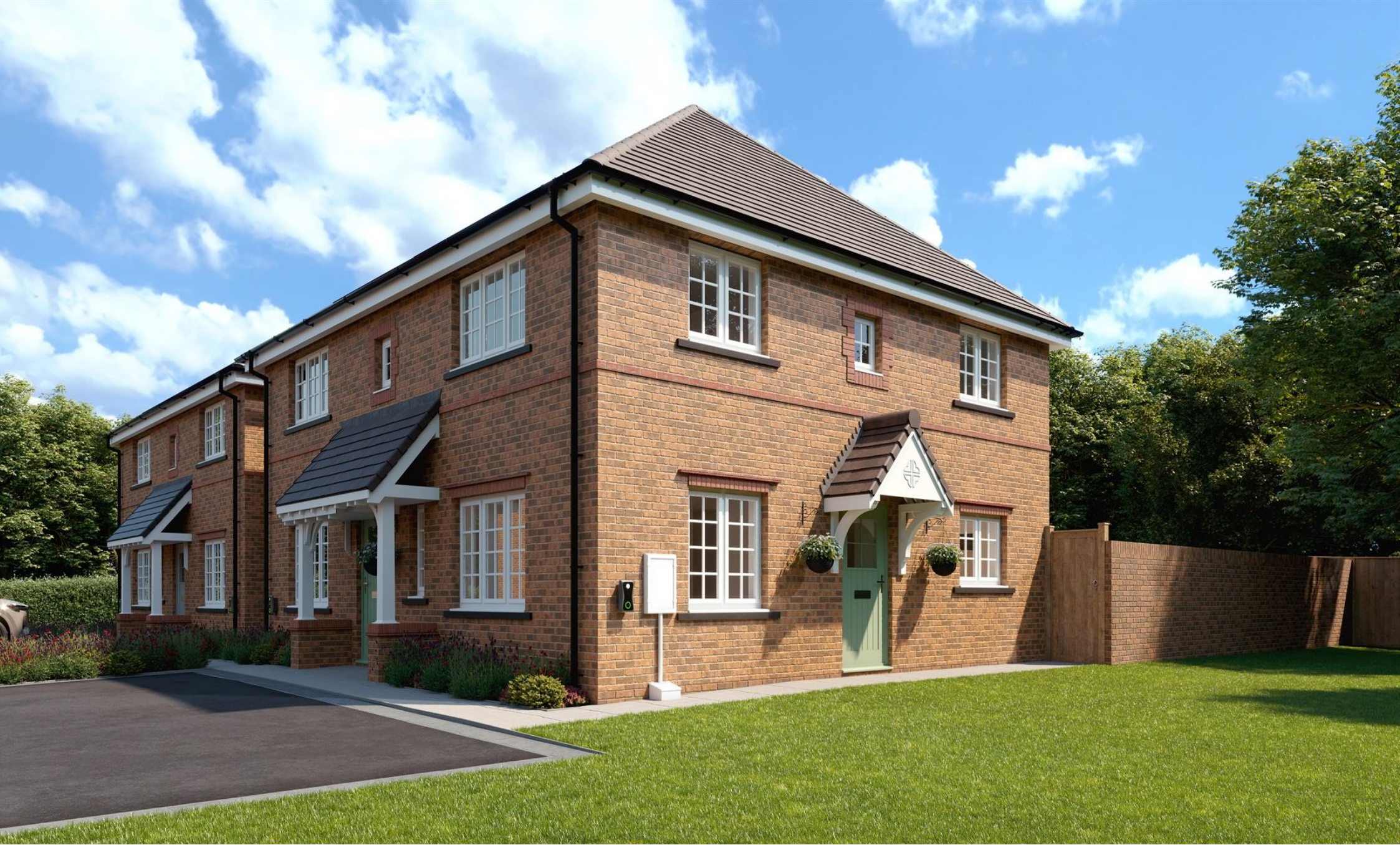
The Brompton Scholars Court, Malvern WR14 3NT

Not for marketing purposes INTERNAL USE ONLY