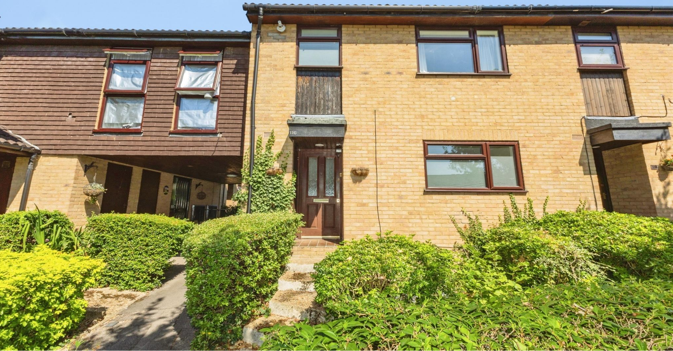
Fleetham Gardens, Lower Earley Reading RG6 4BY