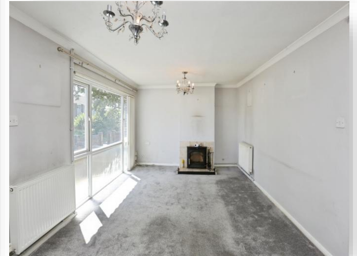
Long Drive, Gosport, PO13 0QU