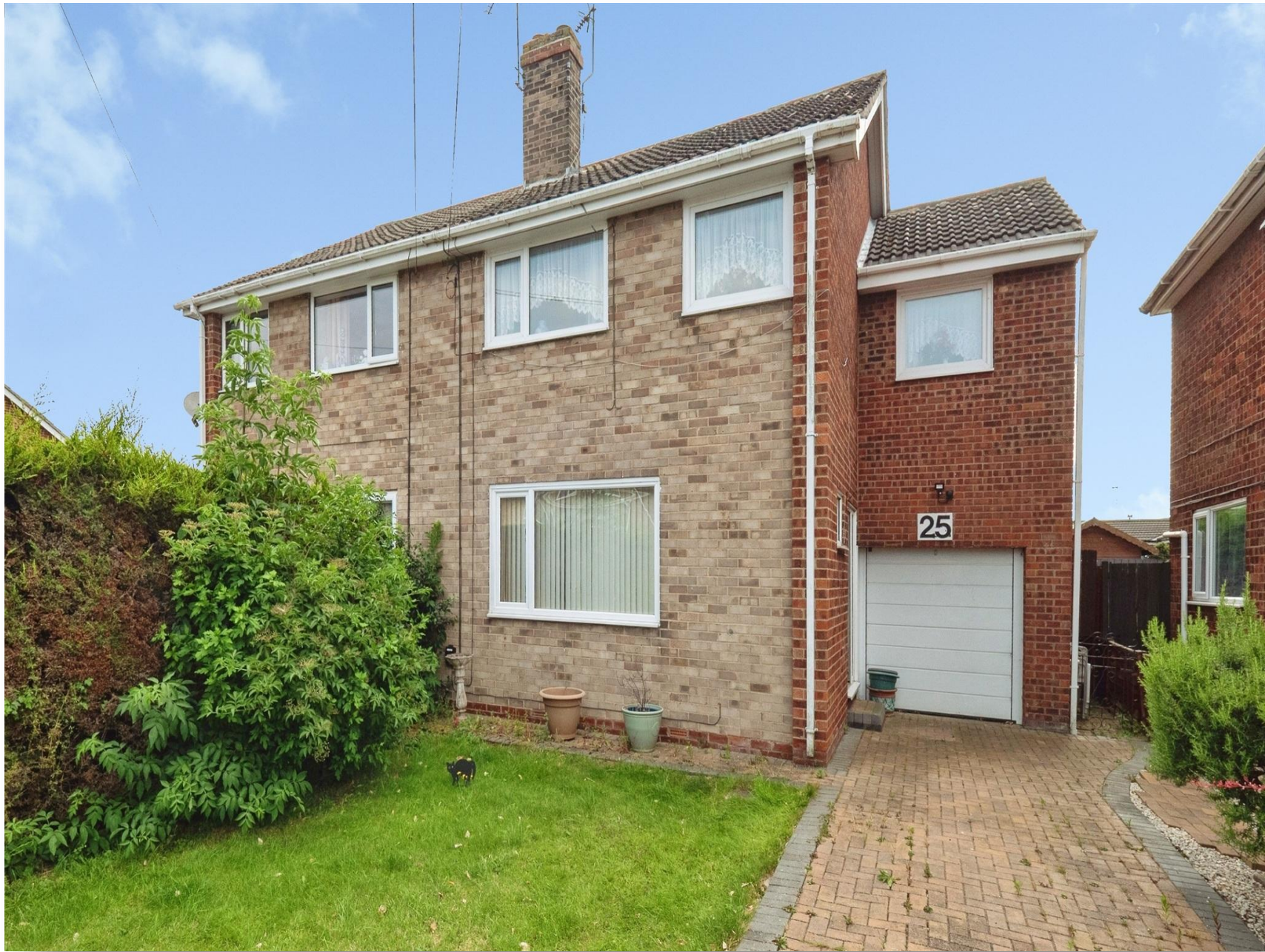
Maple Drive, Beverley, HU17 9QJ