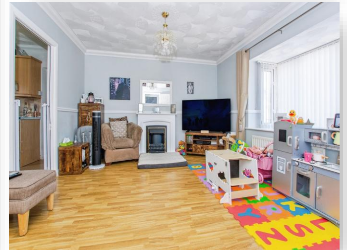
Petts Close, Wisbech PE13 3QE