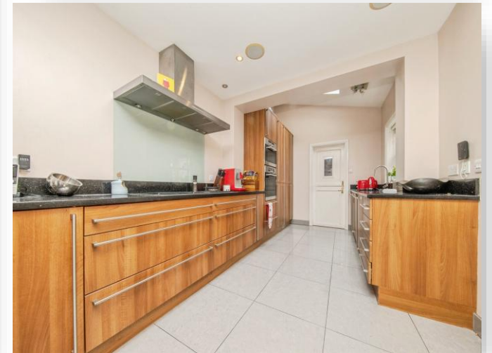
Cardigan Street, Ipswich, IP1 3PF